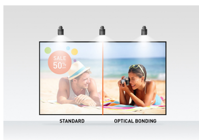
Optical bonded PCAP

The ProLite T2755MSC with its Full HD (1920x1080) resolution and with IPS panel technology offers exceptional colors and wide viewing angles. The Optical Bonded Projective Capacitive (PCAP) 10-point touch technology ensures a seamless and accurate touch response and a lower light reflection, in addition, the display is protected against humidity and potential moisture development. A special Nano coating ensures a smoother touch and less resistance in the swipe. It makes the screen less static and susceptible to dirt, dust and fingerprints. Its flexible stand can be positioned at several angles creating a comfortable and ergonomic user experience. A perfect choice for a vast array of applications.