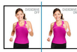
OverDrive ON / OFF

IPS displays are best known for wide viewing angles and natural, highly accurate colours. They are especially suited for colour-critical applications.