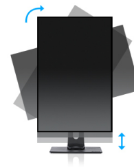
HAS + Pivot

A typical CCFL LCD uses four backlight lamps. Using LED diodes considerably lowers the power consumption and reduces the CO 2 emission into the environment making this LCD a true ECO-Friendly product.