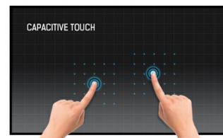
Touch technology - Capacitive

IPS displays are best known for wide viewing angles and natural, highly accurate colours. They are especially suited for colour-critical applications.