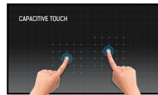
Touch technology - Capacitive

IPS displays are best known for wide viewing angles and natural, highly accurate colours. They are especially suited for colour-critical applications.