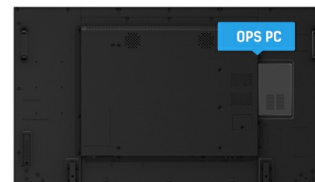
OPS PC SLOT

IPS displays are best known for wide viewing angles and natural, highly accurate colours. They are especially suited for colour-critical applications.