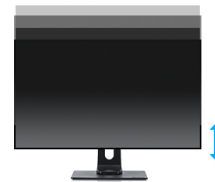
Height Adjustable Stand

With true WQHD 2560 x 1440p resolution your monitor is ready to display high definition images. This means you can accommodate more information on your screen, i.e. over 76% more in comparison to a 1920 x 1080 monitor.