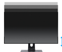
Height Adjustable Stand

With true WQHD 2560 x 1440p resolution your monitor is ready to display high definition images. This means you can accommodate more information on your screen, i.e. over 76% more in comparison to a 1920 x 1080 monitor.