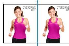
OverDrive ON / OFF

The infrared technology uses infrared backlight. A touch event is registered with great accuracy when the infrared light is blocked by finger or stylus. This technology does not rely on an overlay or substrate, so it is impossible to physically "wear out" the touchscreen. Moreover the display characteristics remain virtually unaffected by the touch functionality.