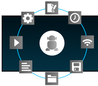
Android İşletim Sistemi

This ELED VA display consumes significantly less power compared to DLED IPS while maintaining the same level of brightness. Its versatile orientation, sleek design, and 24/7 reliability ensure it seamlessly integrates into any business environment. Whether it's used in retail, corporate, hospitality, or educational settings, the LH5560UHS -B1AG will undoubtedly captivate your audience and leave a lasting impression.