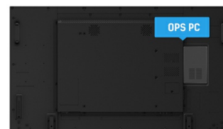
OPS PC SLOT

IPS displays are best known for wide viewing angles and natural, highly accurate colours. They are especially suited for colour-critical applications.