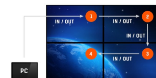
Daisy Chain Support

Thanks to Android OS, you can easily customize the display to your needs by installing applications directly to it.