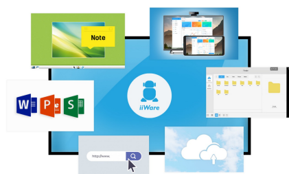
iiWare 8.0 (Android OS)

Share, stream and edit content from any device directly on screen and transform your team meetings or lessons into an easy, fast and seamless interactive session with the included WiFi module ( OWM001 ) and the ScreenSharePro app.