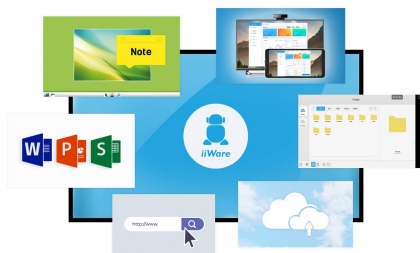
iiWare 8.0 (Android OS)

Share, stream and edit content from any device directly on screen and transform your team meetings or lessons into an easy, fast and seamless interactive session with the included WiFi module ( OWM001 ) and the ScreenSharePro app.