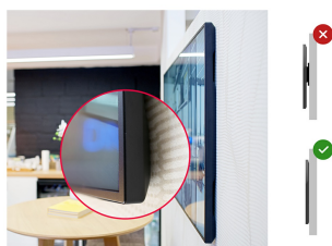
Zero-Gap Wall Mount

Designed to perform in continual, around the clock environments, the LH5570UHB can be installed and utilised in landscape and portrait orientation. The jaw dropping and best-in-class 35mm total depth (when used with the included proprietary brackets) will mean this display can be installed discreetly and elegantly in all areas.